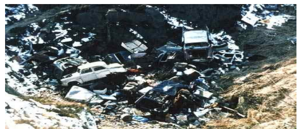
Fig 2: Disposing of solid waste is a serious problem